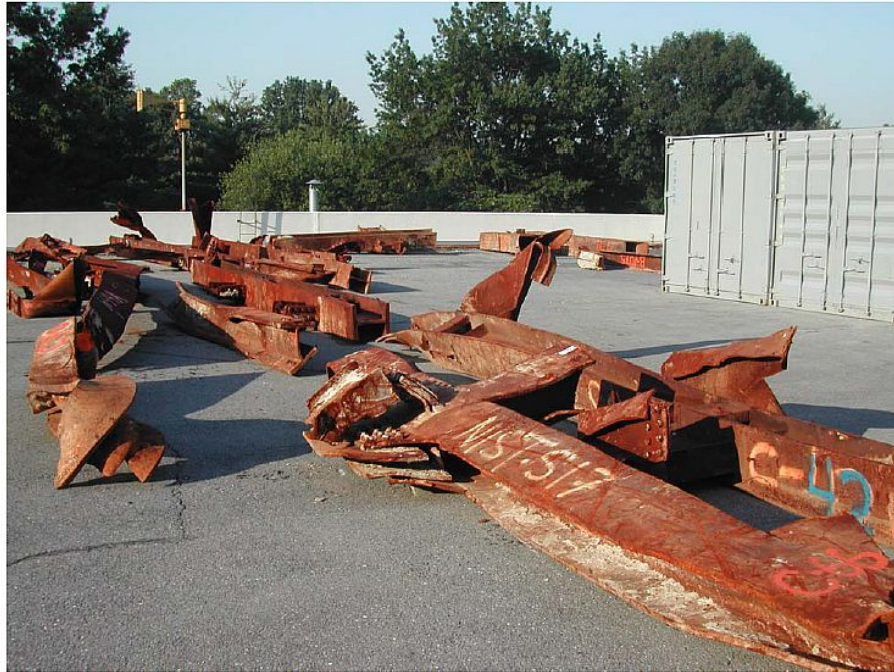
Figure 20. General view of several pieces believed to have been recovered from structures other than WTC 1 and WTC 2